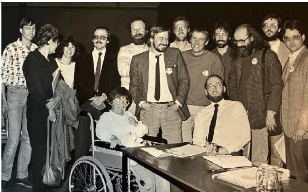
1986: Board of Community Transport Services Ltd.