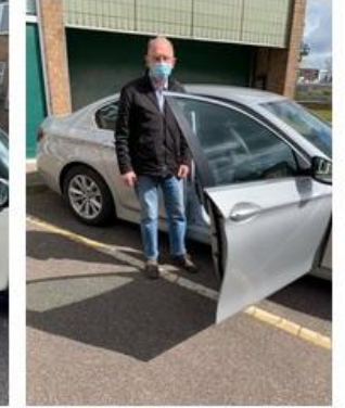
unteer Driver K