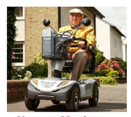
Keep on Moving A transport for all report from Cambridgeshire & Peterborough

https://www.peterboroughtoday.co.uk/news/transport/transport-barriers-for-elderly-and-disabled-peterborough-and-cambs-residents-revealed-in-new-report-3248296